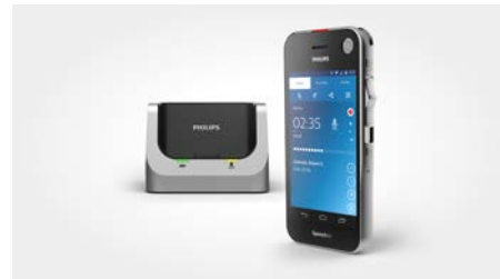
SpeechAir smart voice recorder