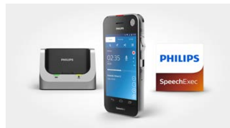
SpeechAir smart voice recorder SpeechExec Pro Dictate workflow software